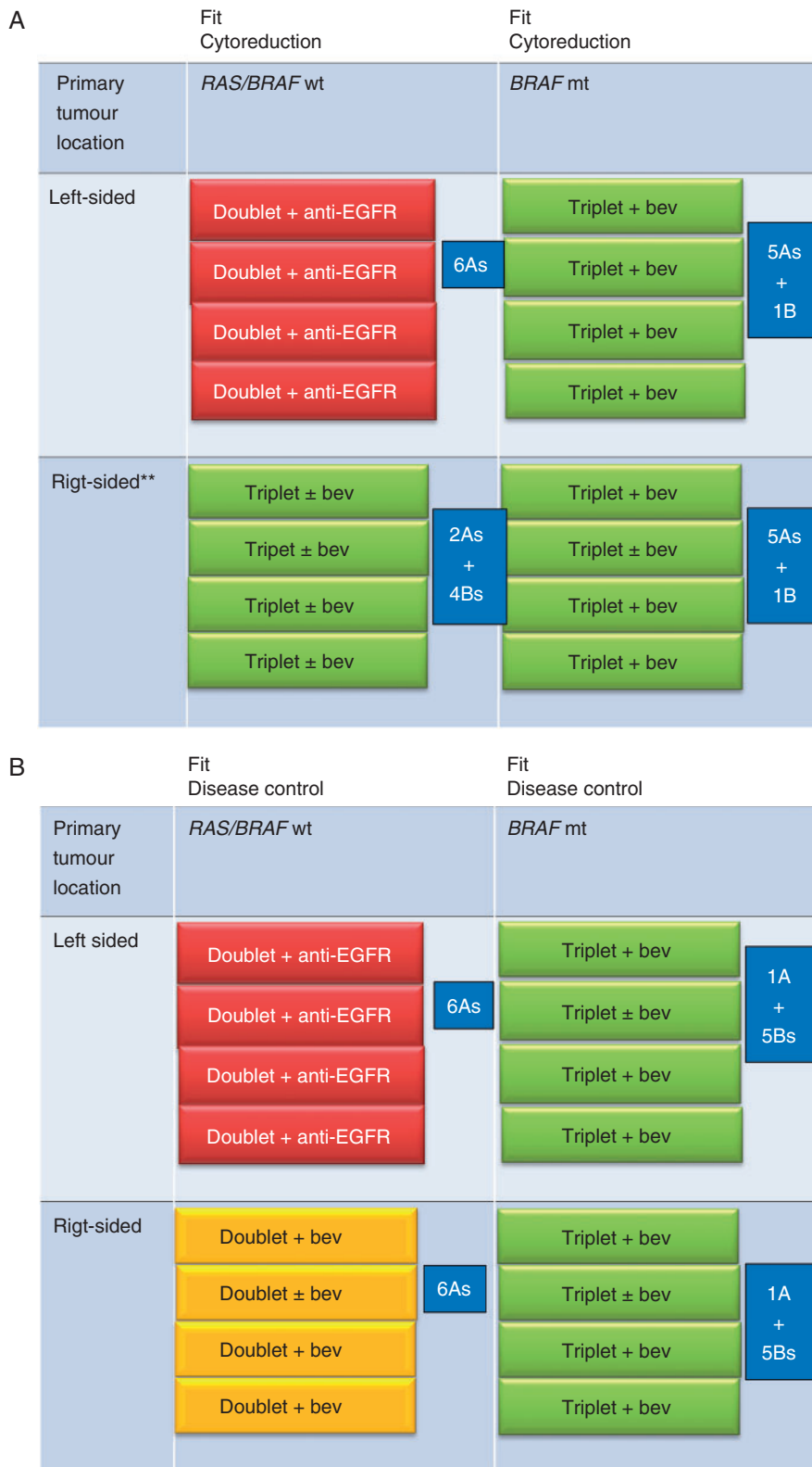
Figure 2. Results of voting on optimal treatment choices according to location of the primary tumour by ESMO experts*. (a) Cytoreduction; (b) disease control. *The ESMO expert recommendations from the meeting provided by the four ESMO experts (AC, FC, JYD, JT) with the voting on the level of agreement for each of the six Asian countries indicated in the blue boxes where A=agree (accept) completely and B=accept with some reservation; **second choice should be a chemotherapy doublet plus EGFR antibody therapy. A triplet ± bev regimen is contemplated for selected, fit patients only. Bev, bevacizumab; EGFR, epidermal growth factor receptor; mt, mutant; wt, wild-type.